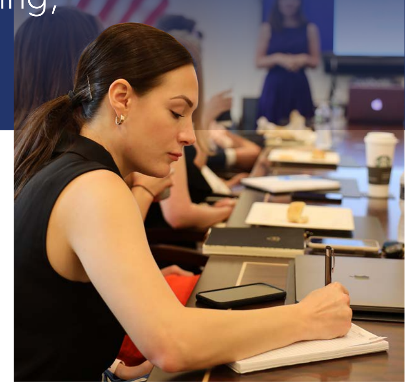
CPI HEADQUARTERS - REVERE PROJECT TRAINING

That's why CPI made training conservative staff (and members of Congress) a pillar of its mission from day one.