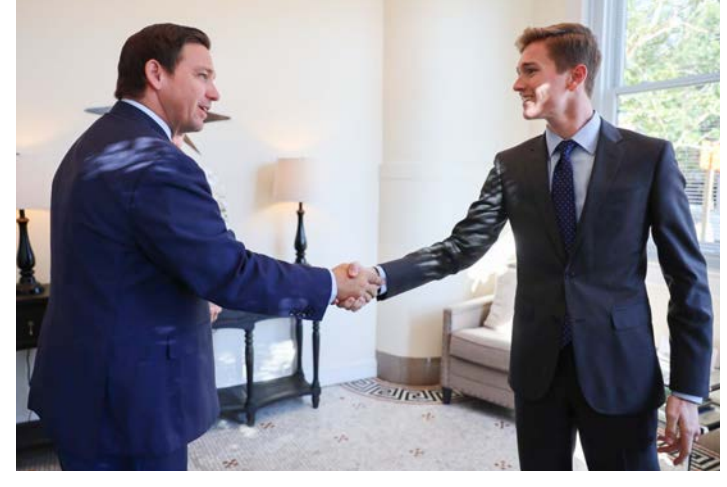
If you know someone who would benefit from a CPI Internship, please visit our website CPI.org/Internships

They developed practical skills and expertise in policy, outreach, operations, communications, networking, and event planning, and routinely came face-to-face with some of the biggest names in the conservative movement.