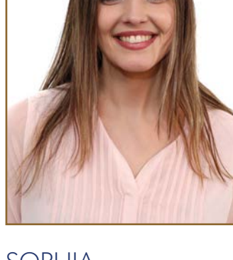
SENIOR DEVELOPMENT ADVISOR