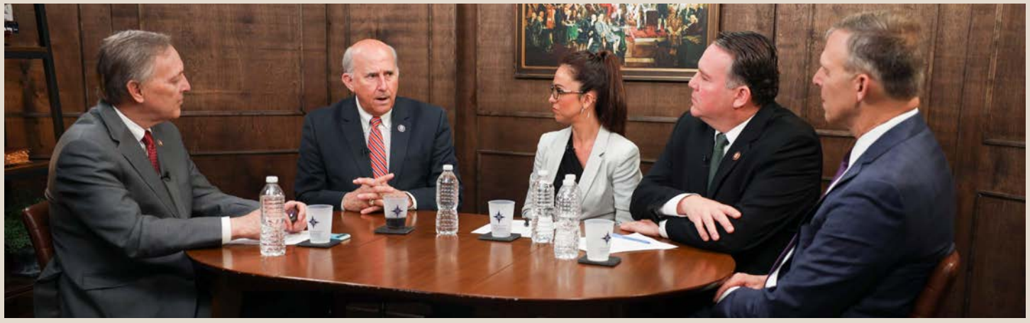
THE HOUSE FREEDOM CAUCUS HOSTS REGULAR POLICY DISCUSSIONS, SHARED VIA FACEBOOK LIVE FROM CPI STUDIOS.

During the first month of 2021, the studio had 40 studio sessions on live TV, radio, and podcast. As word got out about our full-service operation, demand skyrocketed. This number doubled in March when we hosted 77 studio sessions. By May 2021, the studio had topped triple digits at 101 studio sessions. By the end of 2021, the studios had hosted hundreds of members of Congress, visitors, and allied groups and orchestrated more than 1,500 media hits.