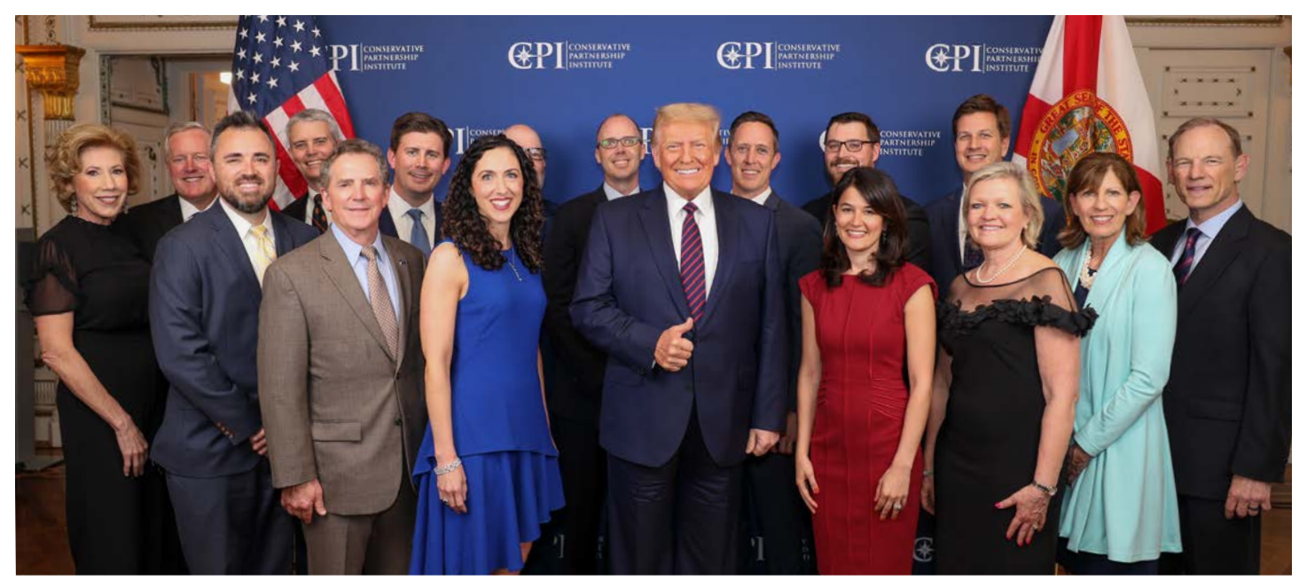
PRESIDENT DONALD TRUMP POSES WITH THE CPI TEAM AT CPI'S STRATEGIC INVESTORS MEETING AT MAR-A-LAGO IN APRIL.